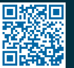
Video jetStamp ® graphic 970